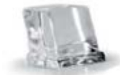
Full Cube - 12 G (26,5 x 26,5 x 26 mm)