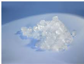
SHAPE OF ICE: